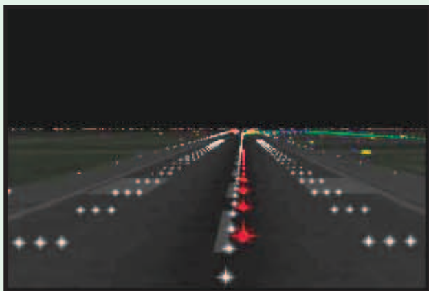
Pilot's view of Takeoff Hold Lights (THLs)

If THLs are RED , STOP! THLs are RED when it is not safe to take off. Remember: Lights indicate status only, never clearance! Surveillance-driven lights turn on/off to increase situational awareness.